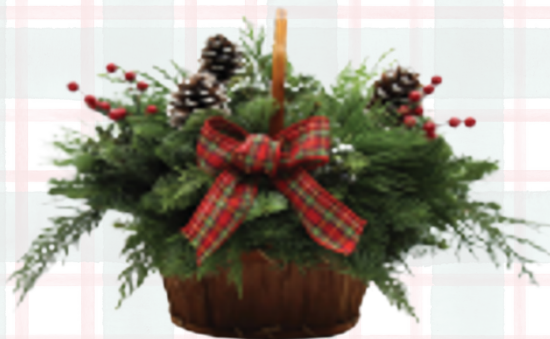
Cedar Bark Basket Centerpiece