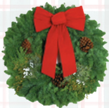
22" Mixed Evergreen Wreath

Hospice Brazos Valley is proud to be the only non-profit hospice serving 17 counties in the Brazos Valley. Our mission is to walk alongside patients and their families during the end-of-life journey, offering compassionate care, comfort, and support. In 2024 alone, Hospice Brazos Valley provided care for 731 patients, totaling 46,847 days of service. Of that, more than $250,000 was unfunded care—care we were proud to give, regardless of cost.